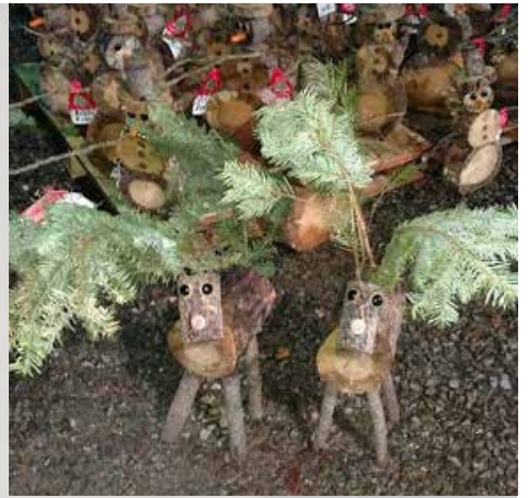
2015 CHRISTMAS PARTY