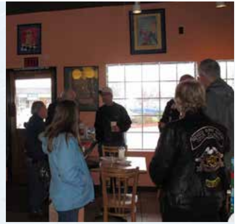
VALLEY OF THE MOON CHILDREN'S HOME TOY RUN