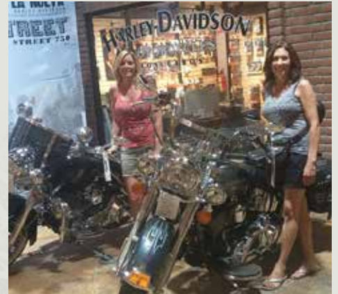
CABO WITH RECHOGRS