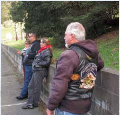
VALENTINE'S DAY RIDE AND GAME