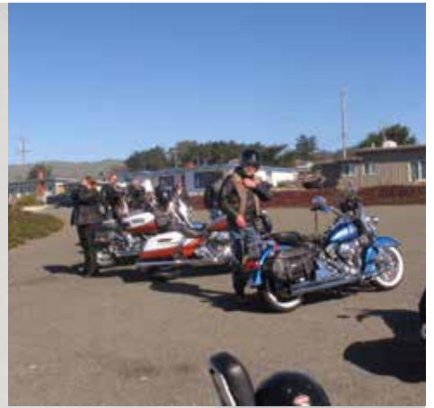
SUPERBOWL 50 RIDE AND PARTY