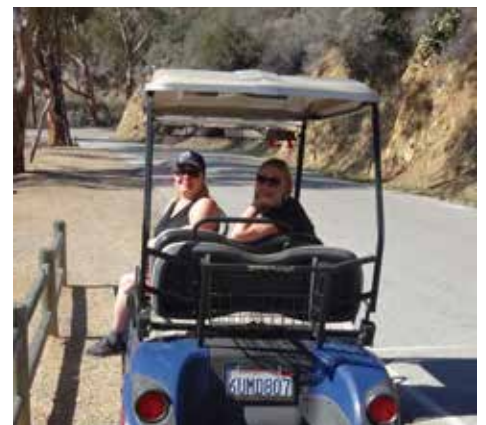
CATALINA/ENSENADA CRUISE WITH RECHOGRS