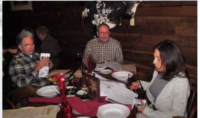
FEBRUARY GENERAL MEETING