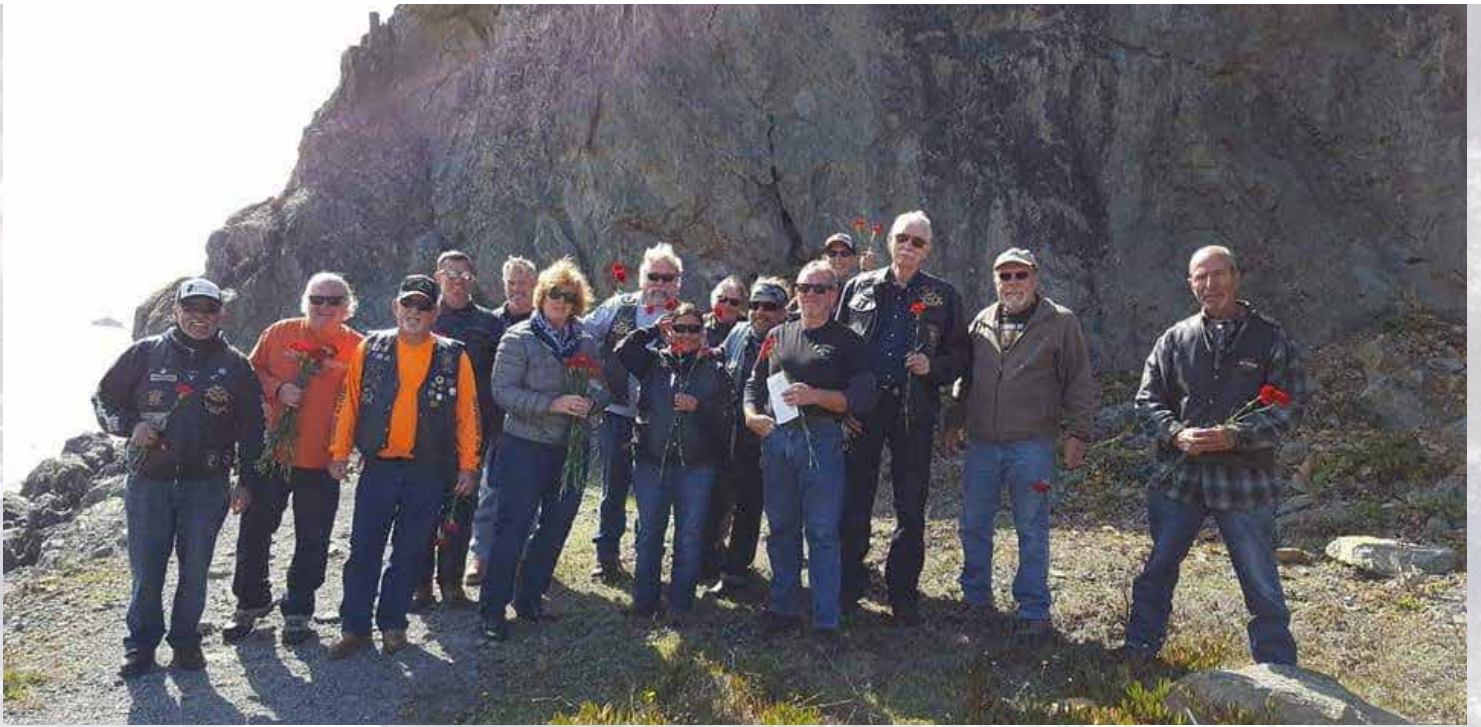
Remembrance Ride 2018