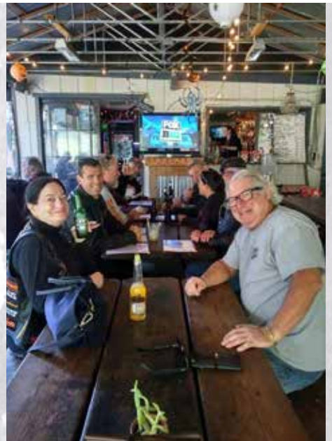
Sturgeon's Mill Lumber Ride 2018